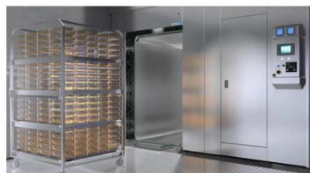
6K litre autoclave – similar to the one to be installed in the vivarium