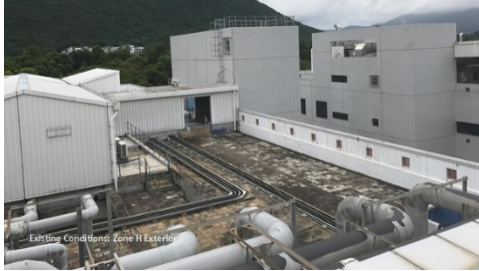
Location of New Expansion – Rooftop of 7H showing outside of 7L