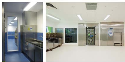
Rack washer – similar to the one to be installed in the vivarium